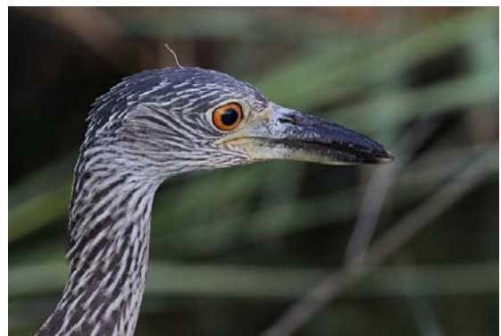
Juvenile Yellow-crowned Night-Heron at North Beach Marsh