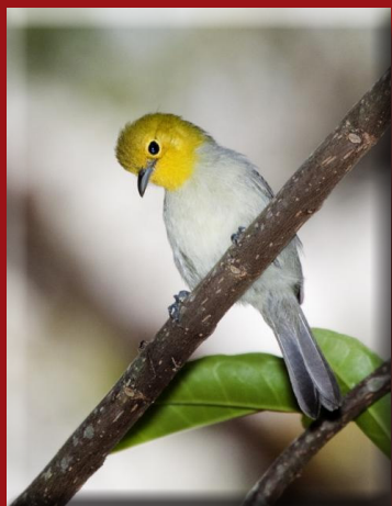
Cuba Yellow-headed Warbler

Newsletter of the Southern Maryland Audubon Society