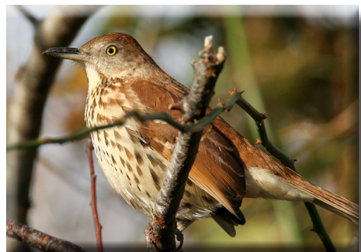
Brown Thrasher

At a recent board meeting the SMAS Board of Directors agreed that the Tailgate Bird Count would be repeated in the Fall of 2011. Watch for more information in the next issue of the Osprey, after the summer break. And "Thank You!" to the members of both teams for helping to raise funds for the Southern Maryland Audubon Society.