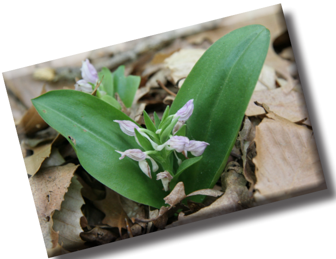
Galearis spectabilis (Showy Orchis)