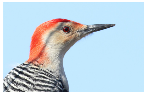
Male Red-bellied Woodpecker at Allen's Fresh, Charles County.