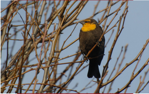
Yellow-headed Blackbird

Newsletter of the Southern Maryland Audubon Society